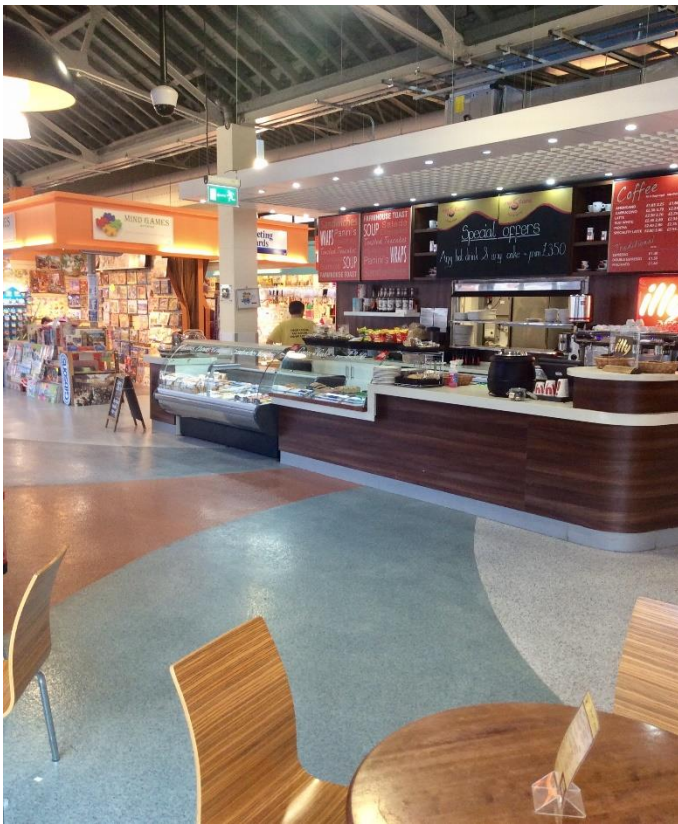
Quartz flooring originated in Italy about 500 years ago, when quarry workers used stone offcuts for flooring in their own homes, opportunities for custom colouring and flexibility in design, quartz fast became a valued material. Deva have carried on with this tradition although our quartz systems are great value for money.