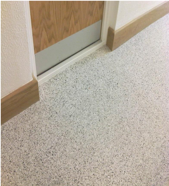
Italian Terrazzo flooring was in vogue during the 1970's but very expensive so the idea of incorporating PVA flakes in thin film resin systems was developed. At Deva, this is being taken further by incorporating our own recycled aggregates in addition to our unique blend of PVA flakes making our Kline System more durable than others on the market.